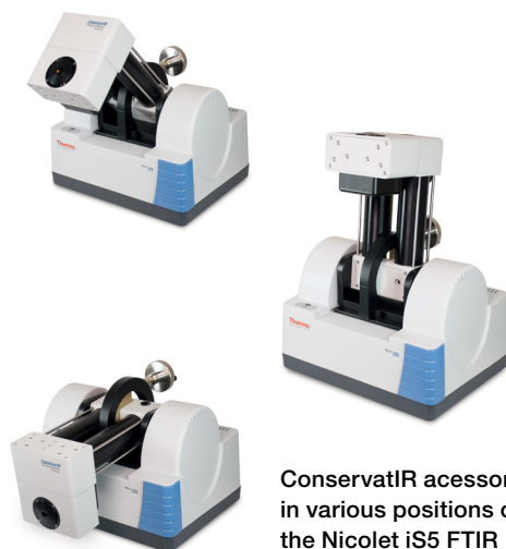
ConservatIR accessory in various positions of the Nicolet iS5 FTIR sample compartment.